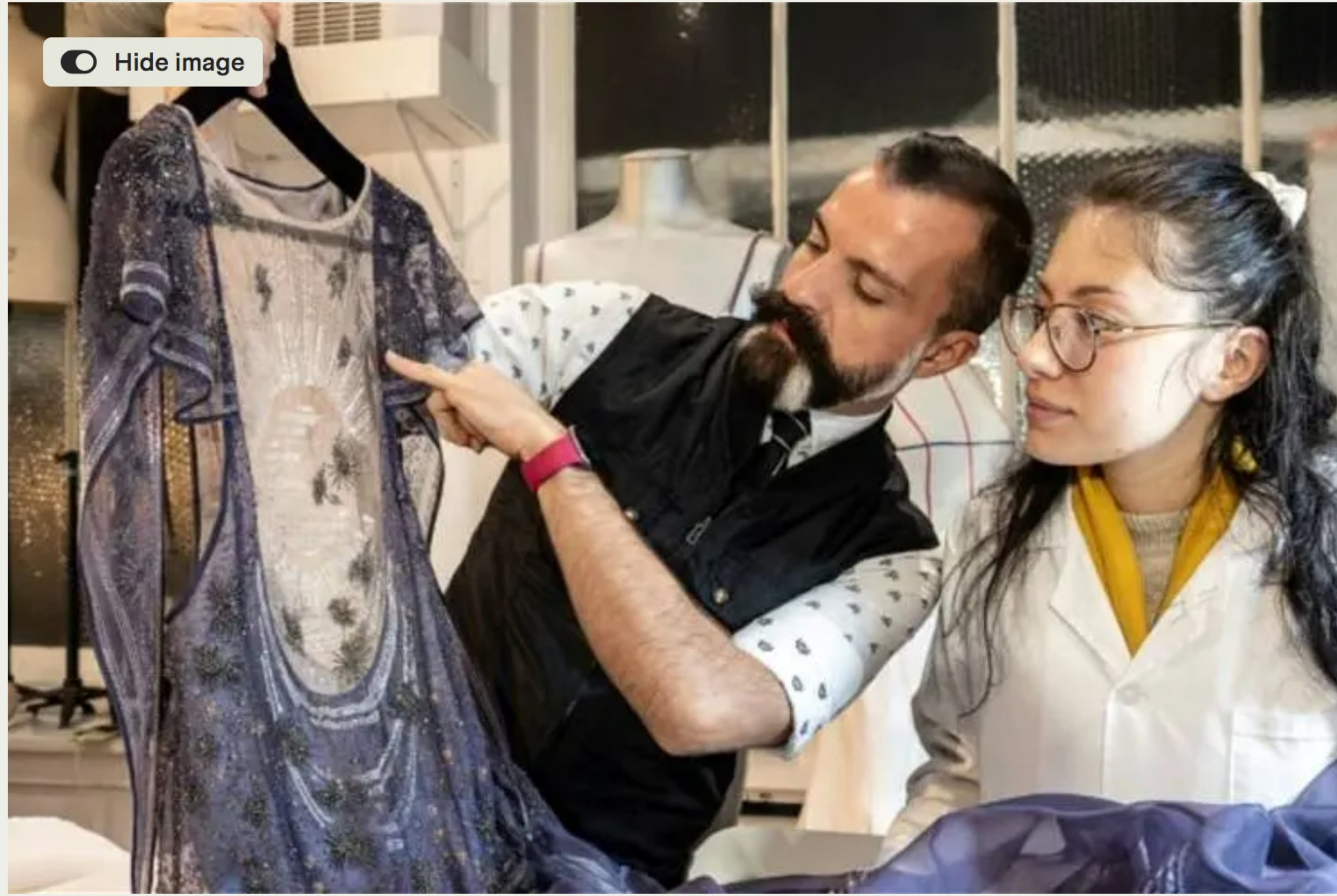
Published 6 days ago · Mumbai, India